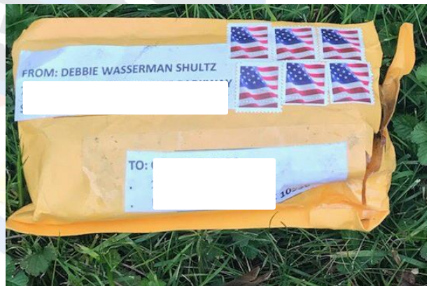
Image of Packaging

Over the course of the last 48 hours, a series of suspicious packages containing improvised explosive devices have been discovered at several locations across the U.S. On Tuesday, October 23, 2018 a pipe bomb was delivered to the mailbox of George Soros in a New York City suburb. Additionally, Secret Service discovered an explosive device on the evening of October 23, 2018, addressed to former Secretary of State Hillary Clinton's Westchester residence. On October 24, 2018, Secret Service intercepted another device addressed to former President Barack Obama, in Washington D.C. According to the U.S. Secret Service, the packages sent to Secret Service protectees were immediately identified during routine mail screening procedures as potential explosive devices and were appropriately handled as such. Both packages were intercepted prior to being delivered to their intended location. An additional fourth viable package addressed to former CIA Director John Brennan has been discovered at CNN headquarters/Time Warner Building in Manhattan. The NYPD is actively monitoring and responding to these incidents. The discovery of additional suspicious packages is ongoing and the NYPD expects additional reports of confirmed and unconfirmed packages or devices.